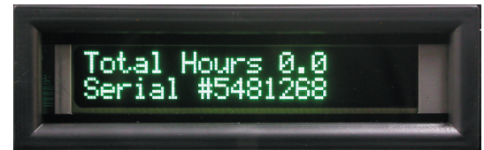
Total Elapsed Hours and Serial Number ID