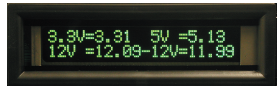
Output System Voltages (DC)