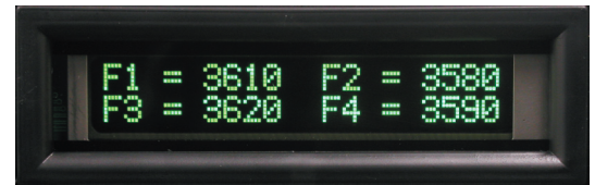
Fan Rotation (RPM)