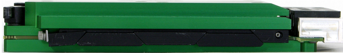
“W” Cooling/Coating Option Shown